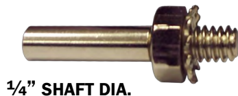
1/4" SHAFT DIA.

ROGO's new 3" Twist-lock Arbor for Rolocs and Abrasive discs is designed for easy twist on/twist off changes.